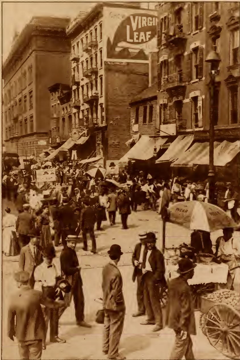
CORNER OF NEW YORK GHETTO. Section of the lower East Side crowded with Jewish families. The shops are in keen competition with the push carts.